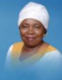
Dr Nkosazana Clarice Dlamini Zuma Minister of Cooperative Governance & Traditional Affairs